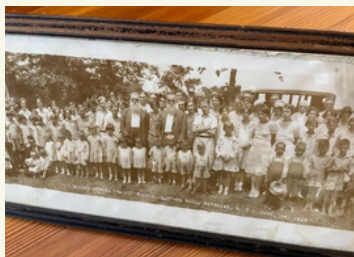
Second Annual "Twins" Picnic